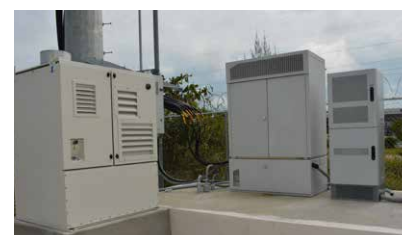
Installations of the Altery Reformer in the Bahamas